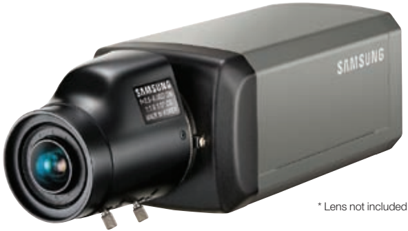
* Lens not included